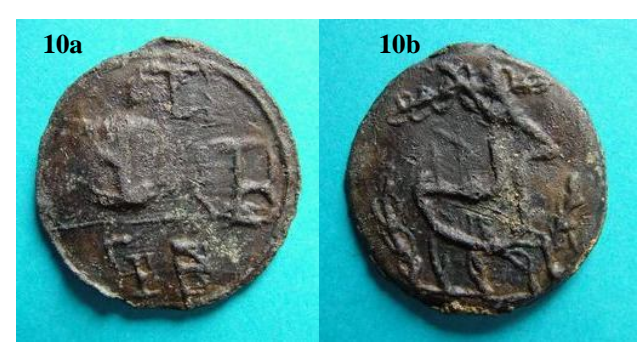
Fig. 10 is the last gentry piece of the group. A stag on the reverse suggests that this might be a permit issued to a participant in a hunt, or the like. There are at least five initials on the obverse, possibly a conventional husband/wife triad plus those of one other person; they are not as well described as the stag, and one wonders who they belong to. They are more easily explainable on humbler pieces, where they might relate to the officials of church or town responsible for

distributing charity. One of its previous owners conjectured that it was a beater's pass.