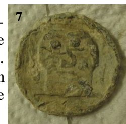
Fig.6 is a humorous face, a pleasantly individual departure from the norm. Contrast with another item in similar vein, Fig.7, found across the other side of the country by Vic Paine at Seaford, in East Sussex; a "Picasso face" as he calls it. Very different type depictions, but amidst the amusement do notice that they both have a similarly sized-exergue; in the case of Fig.6, skilfully worked in to describe part of the mouth.

Taynton MDC have a website at http://www.levumdetecting.co.uk/ , so do have a browse. Two other finds of which Donald has made specific mention are Iron Age silver units of the 2nd cent BC "monnaies-à-la-croix" type.... ..which for those who don't speak the lingo, translates in lead token terms as "cross and pellets". Well some of them have pellets, some the odd crescent or annulet, but all within the good old type 14 family.