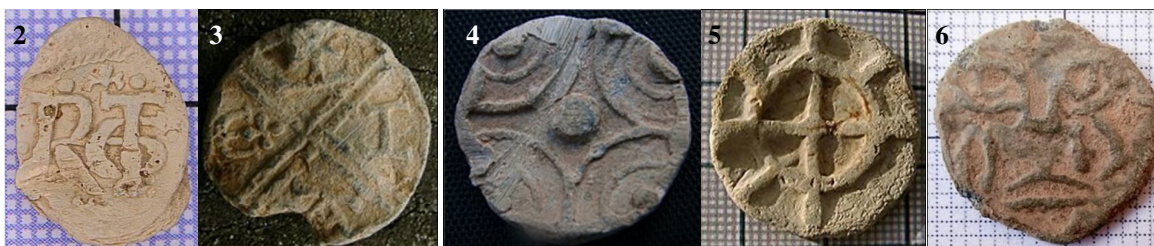
Fig.4 is a nice well-defined type 31 with inverted circles; a pleasant type, not over common. The strong central hub is a plus feature; very useful for picking the piece up when it is upside down, but I don't know whether that is intentional in this case. It looks mid-late 18th cent, as also do the next two. Fig.5 is an example of a cartwheel with unusually thick features; it almost resembles a ship's wheel. The cartwheel design is based on the reverses of the small mediaeval silver coins, i.e. penny, groat and halfgroat, a subject which will be discussed in some detail in next month's LTT.

Quartered pieces with letters {Fig.3} are always pleasant, and we have already dedicated an article to them in LTT_83. The style of this one hints of a date somewhere near the border between Lombardic {Gothic} and modern lettering; maybe early-mid 16th cent. It looks fairly thin, and no doubt smaller than shown.