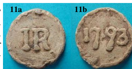
Fig.11 is the only piece in this article which is not confirmedly Scottish. It could be; unlike the others, its provenance is not known. It is well-formed, and at 11.72gm has the weight and chunkiness, more than the typical 18th cent English lead, of several of the other pieces which we have seen above. So, amongst our many anonymities, we may just have one or two Scottish bakers’ tokens!

Public Kitchens, see Fig.10, were the brainchild of Benjamin Thompson, Count Rumford {1753-1814}, a physicist and inventor whose timely creation of large-scale cooking appliances in the 1790s happily coincided with the British authorities’ need to alleviate the hunger of its urban citizens during the shortages of the Napoleonic War. Edinburgh’s was found late in 1799 and a number of references can be found in the local press of Nov/Dec that year. The use of tokens, which he refers to as tickets, is extensively discussed in Rumford’s own writings; some of which, too detailed to be reproduced here, may be readily be found by Googling {"Count Rumford" "public kitchen"} and looking at the recommended Google Books. The piece is 24mm, somewhat pewtery, and weighs 7.04gm.