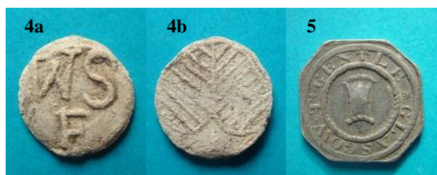
Fig.4 is in D+H under the lead section, where it is listed as Lothian/Edinburgh 136. D+H inverts the reverse and describes it as a heart, but one wonders whether wheat, indicating bread, is intended. Wheat sheaves appear frequently on 19th cent unofficial farthings and also here, on Fig.5. The latter, uniface, is a Glasgow piece, as those familiar with the design of

As for Fig.3, Anchor Close dates back to 1521 and is one of a number of closes just off Edinburgh’s Royal Mile, so the device, if not that of a tavern, may just be a way of indicating an address. It is a solid piece, weighing 10.49gm, even if still only 23mm across.