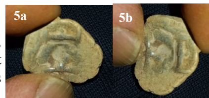
Fig.5a is enigmatic; is it even a token? Shapewise, it is irregular, and it has a bit of a shycok look about it. Peter Jenkins, who sent it in, thinks it has the look of an Edward I head about it, and asks whether it is of mediaeval date. There is certainly some likeness but, turn it round, always worth doing with ambiguous pieces, and all of a sudden you have what could be a pair of initials {Fig.5b}. If that were the case, we are probably talking 17th or even 18th cent.

The piece is pure lead, measures 17-20mm across and varies between 1-2mm thick. The metallic content and style do not look quite right for 1300, although of course the stylised head was used for another couple of hundred years thereafter. Tokens c.1300 were usually pewter, thin and of ecclesiastic origin; they did not usually picture royal heads. Purer lead issues do start in the 14th cent, but usually using simple geometric designs. I still don't feel convinced, but am open-minded. Any opinions?